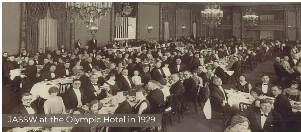
JASSW at the Olympic Hotel in 1929