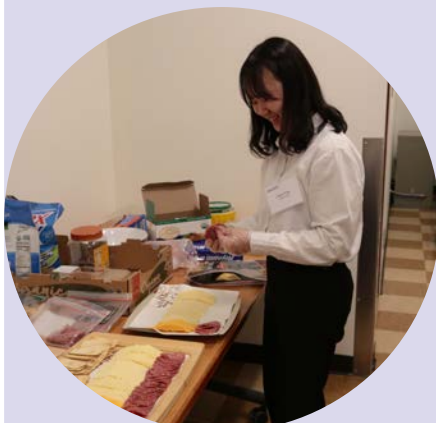
Intern or Volunteer